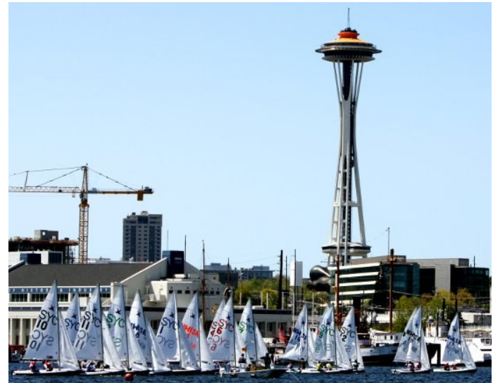
Racers at the 2012 Mallory Championship in Seattle, WA.