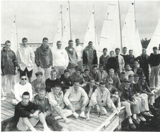
Mallory finalists on the dock at the Coast Guard Academy, 1958.