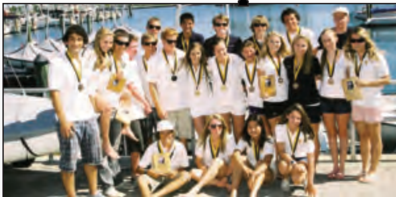
2009 Mallory Champs - top 3 schools