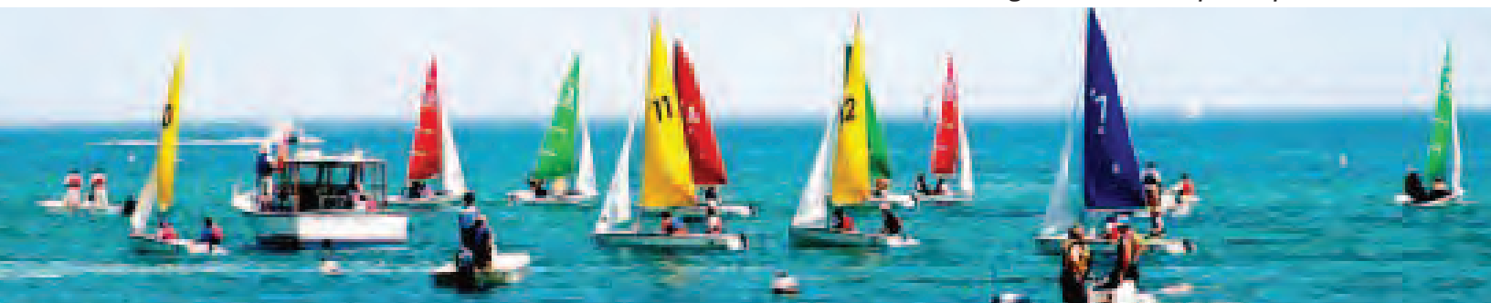
Photo below: Martha's Vineyard was a nice backdrop for the colorful sails used during the Baker Championship.

Photo above: Baker participants gather for a photo.