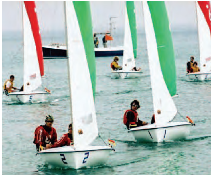
Baker sailors return to the dock for rotation