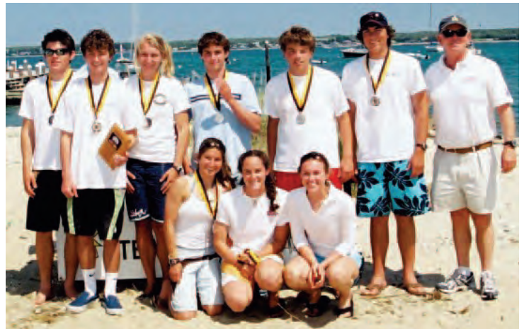
Severn sailors pose for their medal photo. Severn finished 2nd at Baker & 3rd in Mallory

At 1030, running 34 races by 4pm to complete the qualifying round was not possible, so a coaches meeting was called to brief about Plan C. Schools were ranked 1-6 by the results up to race #30 in pre-determined divisions and sail offs were arranged.