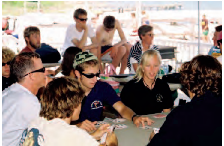
Waiting for the wind.....