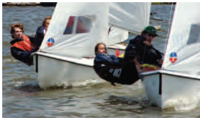
Photos: PCISA Baker Elims held at Sequoia Yacht Club in Redwood City.

Thanks to all participating sailors, schools, coaches, and parents. Special thanks to all race judges, committee volunteers, Peninsula Youth Sailing Foundation, and Sequoia Yacht Club for all of their hard work and kind hospitality. Great racing and good sailing by all.