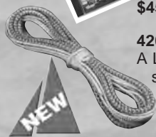
420 Tapered Spinnaker Sheet

A Layline Exclusive! These machine-tapered sheets are hot in Europe, so we're importing them just for you. 49' overall length.