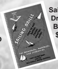
Sailing Drills BOOKSD $29.95