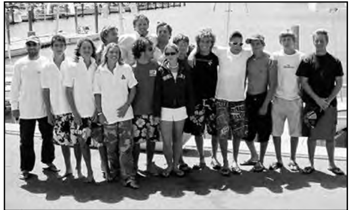
SAISA team racing champs from the Antilles School (in white shirts) pose with the runner-up team from Martin County HS

Antilles compiled a 14-2 record for the two days and Martin County had a 10-6 total. The two schools qualified as the SAISA entries in the Baker regatta May 22-23 at the US Naval Academy. Ransom Everglades School at 9-7 finished third, Lakewood HS was fourth at 5-11 and H.B. Plant HS finished fifth with 3-13. Antilles School from St. Thomas, USVI, is in its first year of interscholastic competition as interest grows among Caribbean schools.