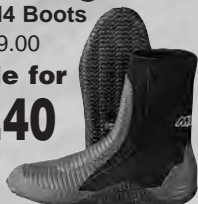
Musto M3 Boots Were $75.00