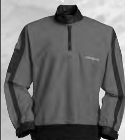
Henri Lloyd Breaker Spray Top

Sizes: XS, S, M, L, XL, XXL Colors: Red, Royal, Yellow, Coral, Navy, Wedgewood