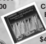
Competitive 420 Boathandling CD