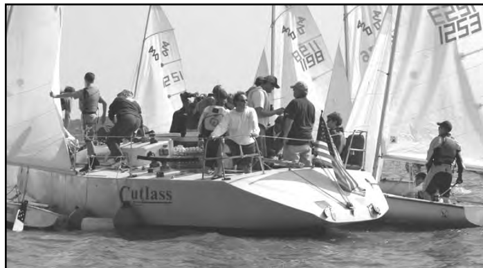
Boat rotation at 2003 Great Oaks Regatta