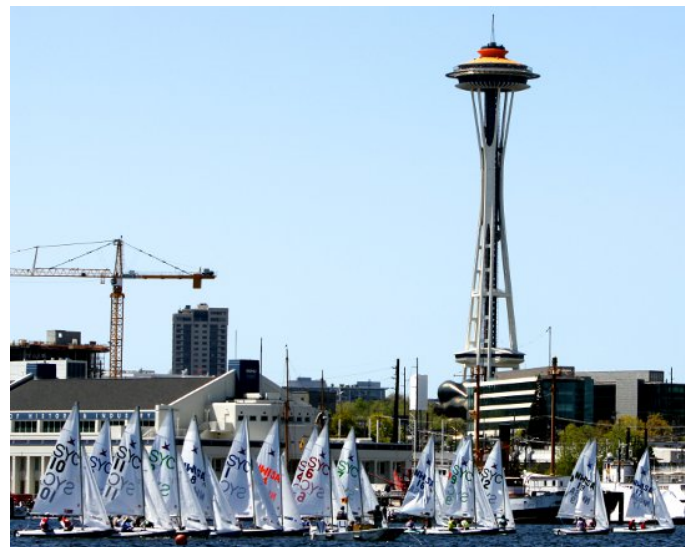
Racers at the 2012 Mallory Championship in Seattle, WA.