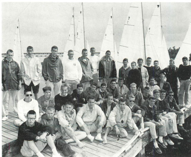
Mallory finalists on the dock at the Coast Guard Academy, 1958.