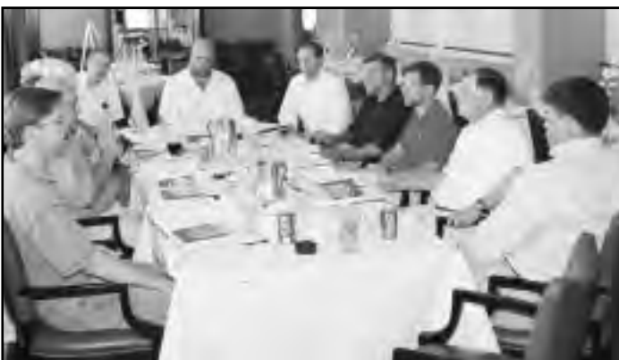
ISSA members at the annual meeting deliberated around a large table

Sailing School • Teen Sailing Trips • Summer Camp • Sailing for Disabled