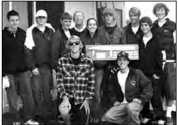
At the Anteatr Regatta Roy Disney (center behind back row) presented the Disney Trophy to the Pt. Loma HS team members, honoring their virtual sweep of 2004 PCISA and ISSA championships