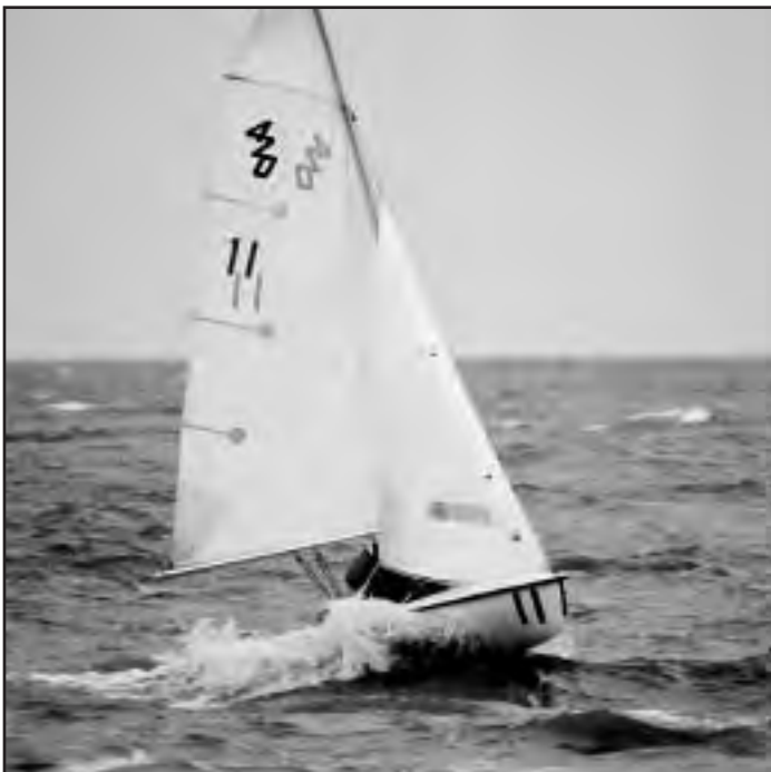
Bumpy water on Lake Pontchartrain at the Great Oaks

All your performance sailing needs online