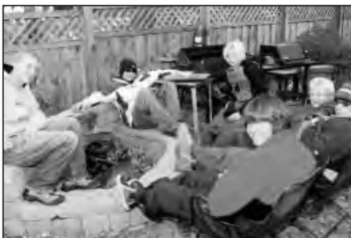
In the Minnesota chill a fire was the place to wait for a breeze at the Cressy regatta