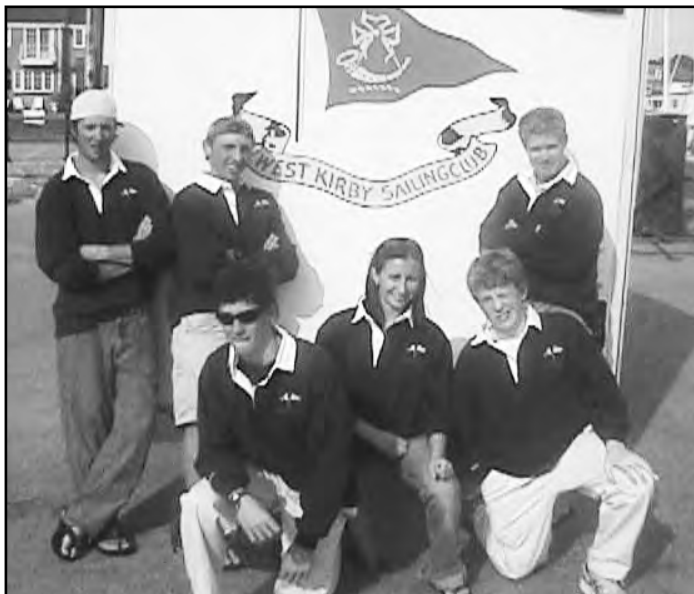
The runner-up Hotchkiss team looks cool posing after the BSDRA regatta in West Kirby.

To check out more detailed results of all the spring regattas in NESSA, go to our website at www.nessa-sailing.org to see the latest information and results.