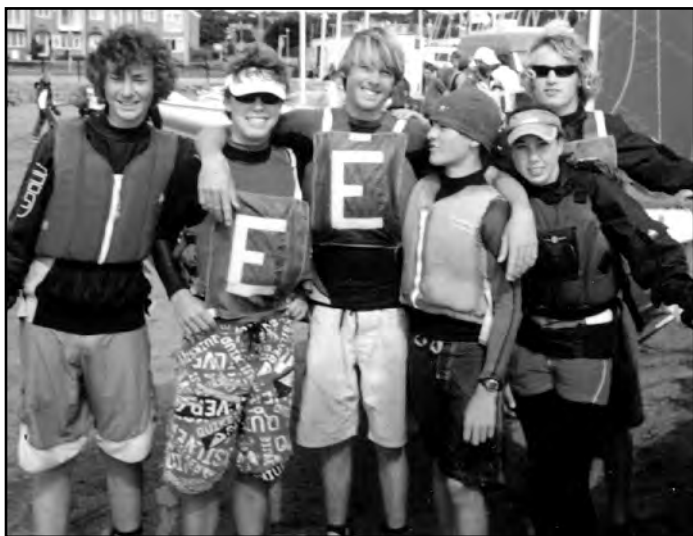
The Pt. Loma team celebrates winning the BRSDA International Team Racing Championship.