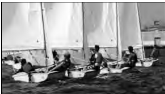
Aligned downwind at the Mallory Regatta.