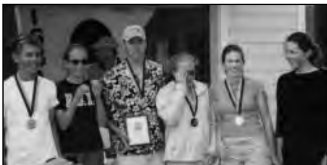
The runner up Bishop's School team at the Mallory regatta