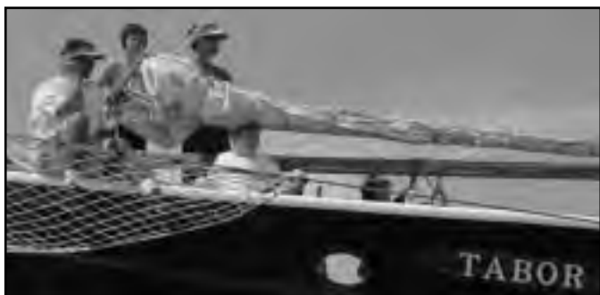
Ideal viewing at the Baker Regatta from aboard 'Tabor Boy'