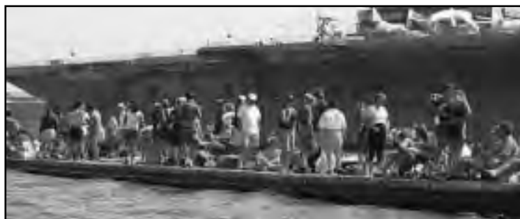
The dock at College of Charleston — with USS Yorktown as a backdrop — was great for watching the action at the Mallory (below).